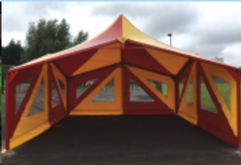
6m x 6m Bede Community Primary, Gateshead.