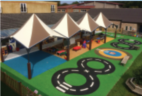
18m x 4.5m St Gabriel's Pre-School, Newbury.