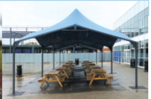
18m x 6m St Joseph's RC High School, Bolton.

Early Years Classroom canopies for freeflow