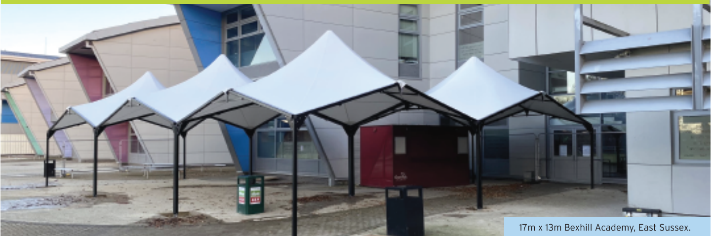
17m x 13m Bexhill Academy, East Sussex.

Creating a large covered seating area also ensures this type of service can be contained to a specific area.