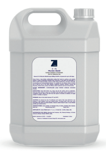
Visual only - label may differ